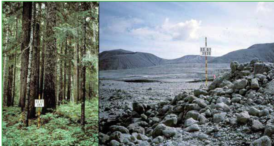
Mount St. Helens, before and after

Bangor Theological Seminary, as we know it, will never be the same again. Many if not most of us have found ourselves and our paths forever changed. For me, it's been a difficult time and the trajectory